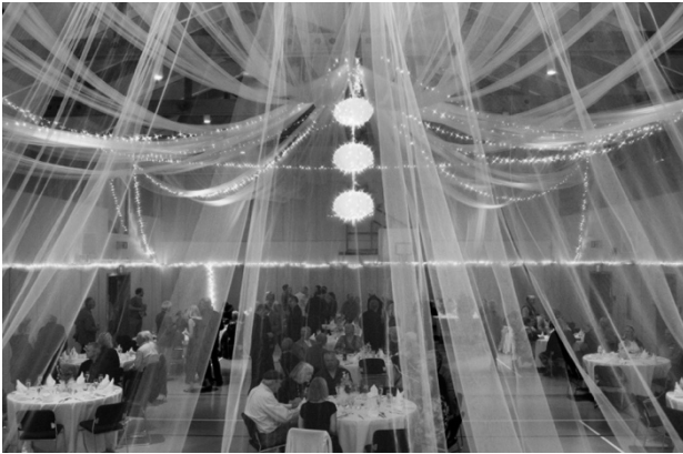
The main gym can accommodate 300 guests

For rental availability and rates please contact: Melanie Gaines 250.539.2452 or mgaines0@icloud.com